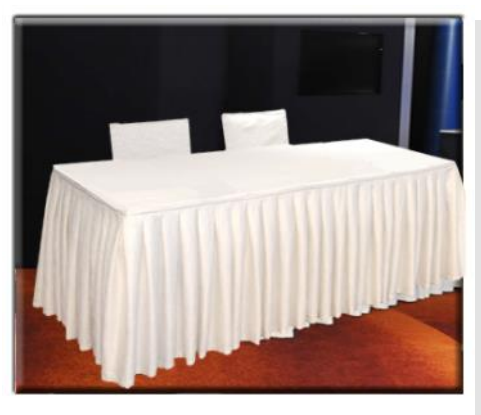
Sponsor Exhibit Area